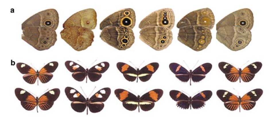
Figure 2 Extensive morphological variation in the wing patterns of B. anynana and Heliconius provide exciting opportunities for comparative work into the interplay between genes, development, and ecology. (a) Variation in Bicyclus wing patterns is extensive within and across species, and laboratory B. anynana provides the opportunity to study different types of variation (e.g. due to plasticity, to many alleles of small effect, or to single alleles of large effect) in detail. The B. anynana Stock Center in Leiden maintains over 20 lines with divergent phenotypes generated by artificial selection and over 30 mutant stocks carrying spontaneous mutations of large effect. The panel shows the ventral surface of both fore- and hindwing in different stocks of B. anynana. The first two photos on the left correspond to the 'wild-type' outbred stock and illustrate the seasonal polyphenism that results from plasticity in relation to temperature and humidity during development (Brakefield and Frankino, 2006) (on the left, a butterfly with conspicuous eyespots typical of the 'wet season', and to the right a dull-colored butterfly more typical of the 'dry season'). The remaining photos correspond to different mutant stocks with altered eyespot patterns (from left to right: Bigeye with enlarged eyespots, spotty with extra eyespots on the forewing, Goldeneye with the typically black ring replaced with golden scales, and Missing with two eyespots absent from the hindwing). (b) The radiation in Heliconius color patterns couples both divergent evolution and multiple independent cases of convergent evolution. Different Heliconius species can be easily maintained in captivity and different populations or closely related species can be crossed to study naturally occurring variation. The panel shows geographic variation in the mimetic species, H. erato (top row) and H. melpomene (second row). The two species fall on divergent lineages in the genus, yet share identical wing patterns across their sympatric ranges and have undergone a parallel radiation into over 30 different geographic forms (Sheppard et al., 1985). Color pattern variation in these species is largely explained by changes at 4–5 loci or complex of tightly linked loci of large effect. For example, allelic changes at the Cr locus in H. erato and in a complex of at least three tightly linked loci (N, Yb, Sb) in H. melpomene control most of the variation in yellow and white pattern elements among five geographic races shown. See acknowledgements regarding source of photographs.

The genetic and developmental basis of wing pattern(s) formation also seems distinct in the two target groups. Study of laboratory populations of B. anynana